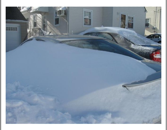
Here it is in Key Largo on February 21<sup>st</sup>:

So, here's my car in NJ on December 27<sup>th</sup>: