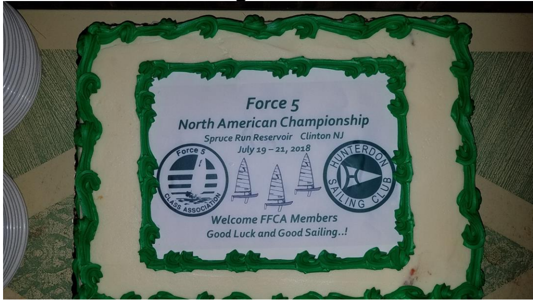
Force 5 National Regatta at HSC - A Success!

We had an excellent showing for the Force 5 North American Championship Regatta with 38 sailors participating from across the country for this 3 day event on July 19^{th} - 21 st. HSC was well represented with 14 F5 sailors and others from near and far – with some travelling from Texas, Illinois, South Carolina and Georgia. Our HSC team did an outstanding job of supporting the event and making our guests feel welcome at Spruce Run.