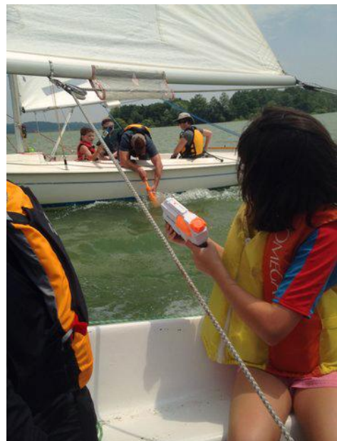
Hijinks at the Scot Scramble...pg. 2!