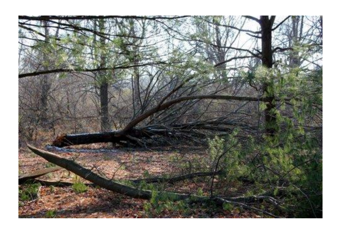
Hurricane Sandy hit our region hard, and Spruce Run Recreation Area was no exception. Damage reports and more photos starting on Page 7.