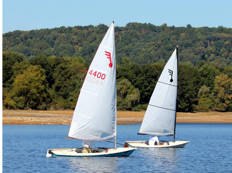
Force 5 Fleet 1<sup>st</sup> Place: Doug Brown 2<sup>nd</sup> Place: Rich Baumann