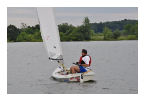
More Pictures from the Force 5 Mid-Atlantic Championships!