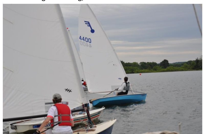
Other Force 5 News

We're into the Summer Series and it looks like participation will be up from the Spring. All members should remember that we have a club boat collecting dust on most Sundays and we'd be happy to have you join us.