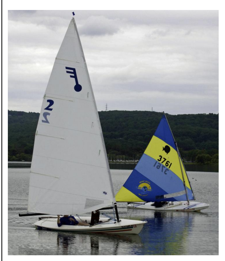
A Force 5 and a Sunfish come to the finish line during Sunday Series racing on July 3<sup>rd</sup>.

"Crew U" will held on Saturday , July 16 <sup>th</sup>, at 10AM. Gordon Sell will lead the group through a quick overview of the basic terms and the typical crew responsibilities, followed by lots of hands-on time on the water with the help of the Flying Scot Fleet.