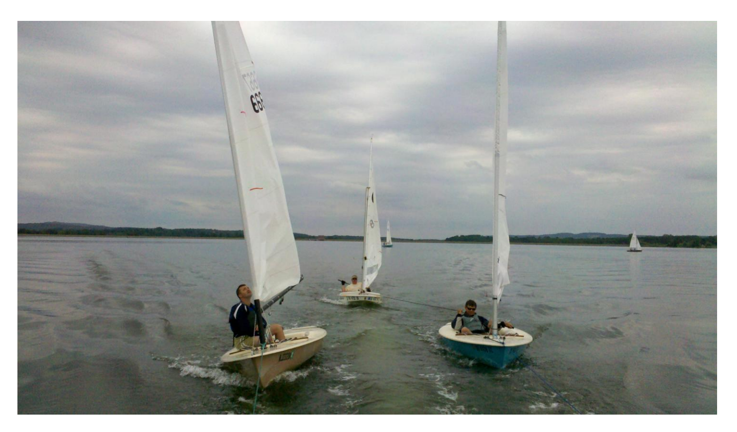
Force 5's and a Sunfish "following" the RC Boat back to shore in light (?) winds...

For Membership & Training contact Rich Baumann at: <a href="mailto:membership@SailHSC.org">membership@SailHSC.org</a>