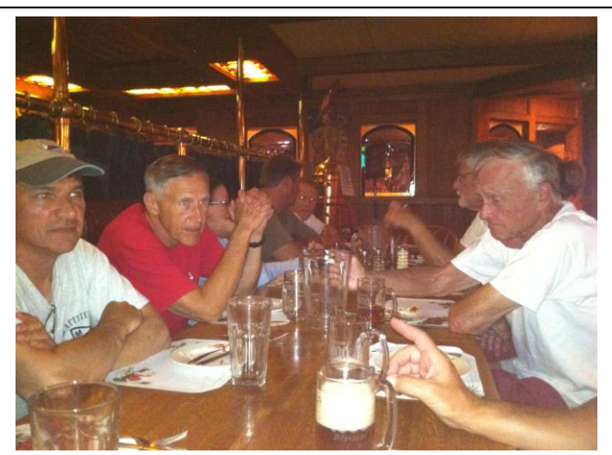
"I think we need another Pie..."