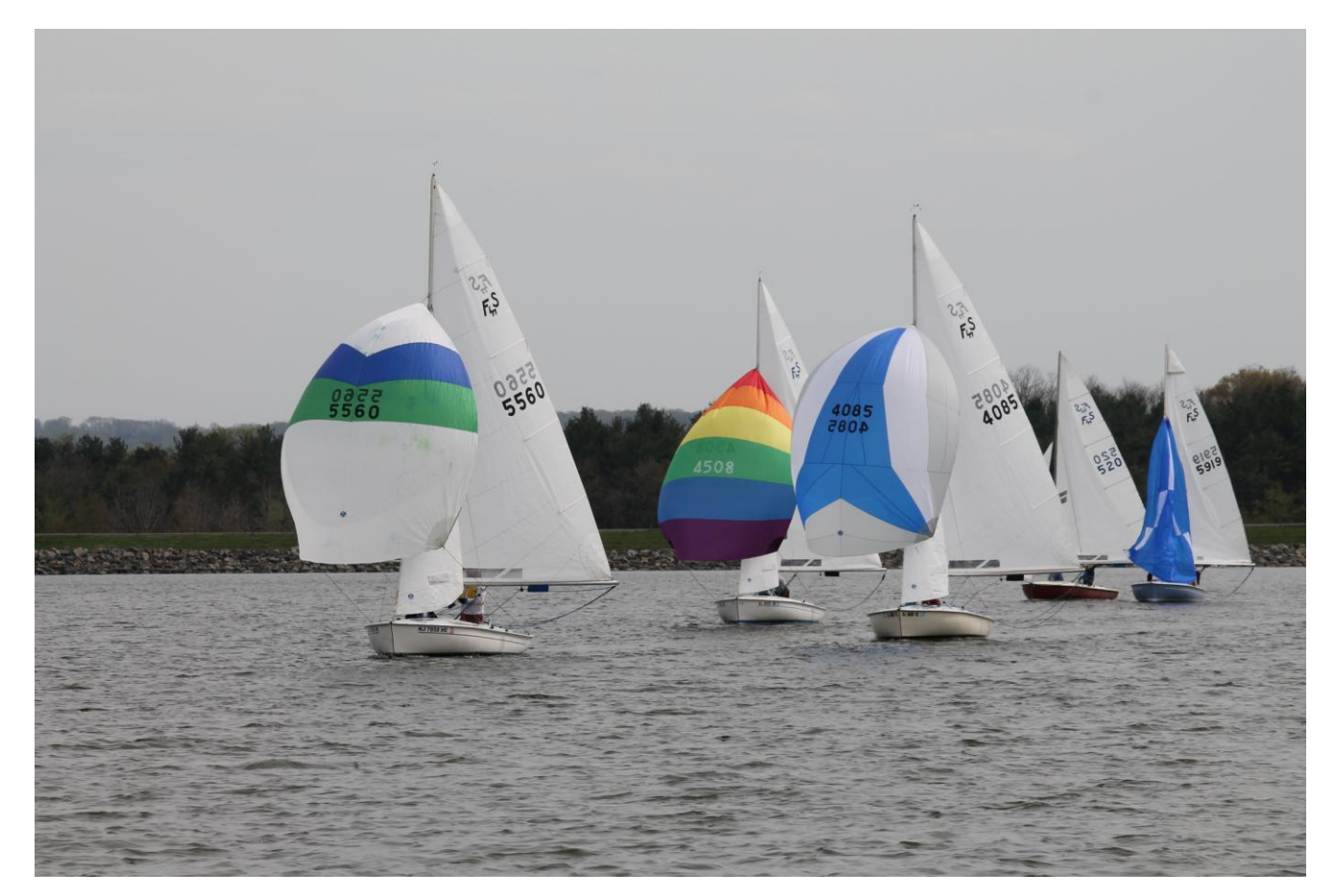
The 2013 Flying Scot "Challenge of the Lakes" at HSC

For Membership & Training contact Rich Baumann at: <u>membership@SailHSC.org</u>