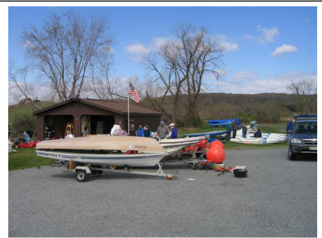
Many more Work Day pictures inside!

5/18 - Learn-To-Sail Swim Checks 5/27 - Memorial Day Sunfish Regatta 6/1-6/2 - Force 5 Mid-Atlantic Championships @ HSC