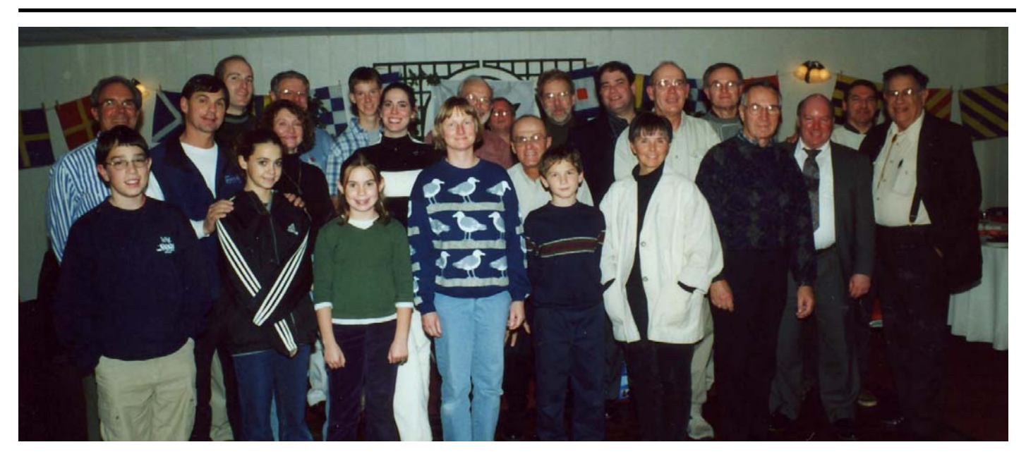
Some of the large group of HSC sailors that enjoyed the 2002 HSC Dinner last November