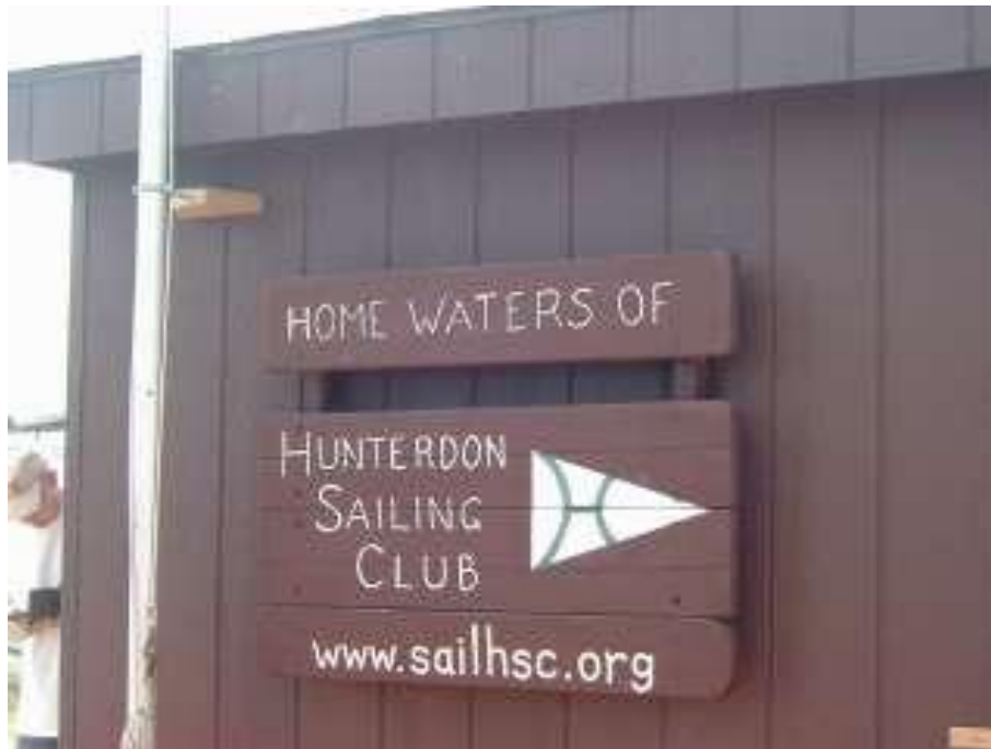
APRIL 18 LAUNCH DAY!

Daylight is lasting longer and we will be back on the water soon! Mark your calendars now for 'All hands on deck', Saturday April 18 (or rain date Sunday 4/19). That's the day we launch the See Witch One . Many hands are needed to lift her back in, and there are the usual spring commissioning tasks. Thanks to everyone's efforts last year the clubhouse and grounds are in pretty good shape, so spring clean up should go easier. Mayberry Sales has serviced the 2 Honda outboard motors, and we'll recharge our batteries so we are ready to go.