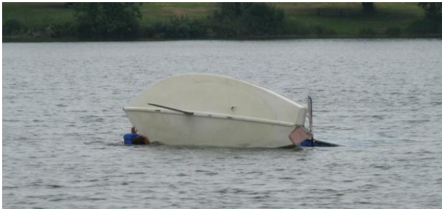
Practicing What you Need to Know