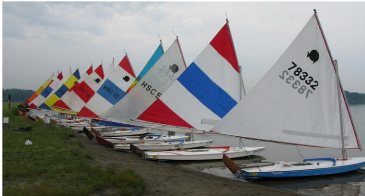
Rigged & Ready