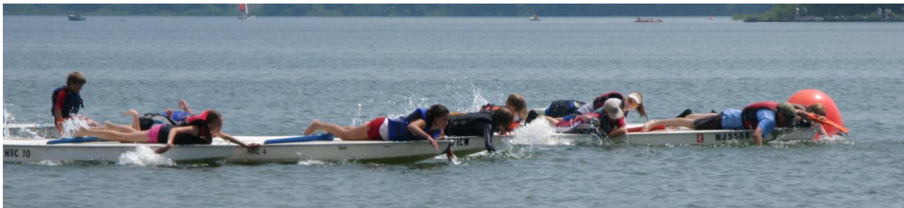
Racing without Rigging