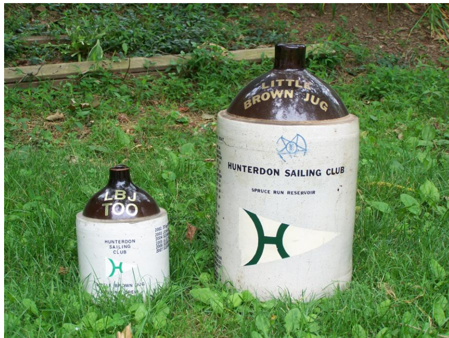
The Little Brown Jug and LBJ TOO

To receive Foc's'le in color by email (and save HSC some $) send note to force5@verizon.net with "Foc's'le by email" in the subject line