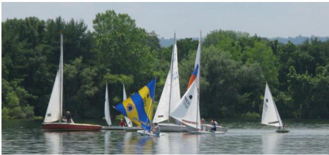
Sunfish sailor’s nightmare – a crowded, light air, mark rounding shared with Flying Scots.

*HSC members are asked to volunteer sailboat rides to participants on a first-come, first-served basis controlled by would-be participants being given a numbered ticket. The HSC exhibit in addition to a member solicitation/information desk will include examples of the types of sailboats used by the club. Volunteers on a rotating basis are asked to help here as well as help in setting things up early on the 18 th .