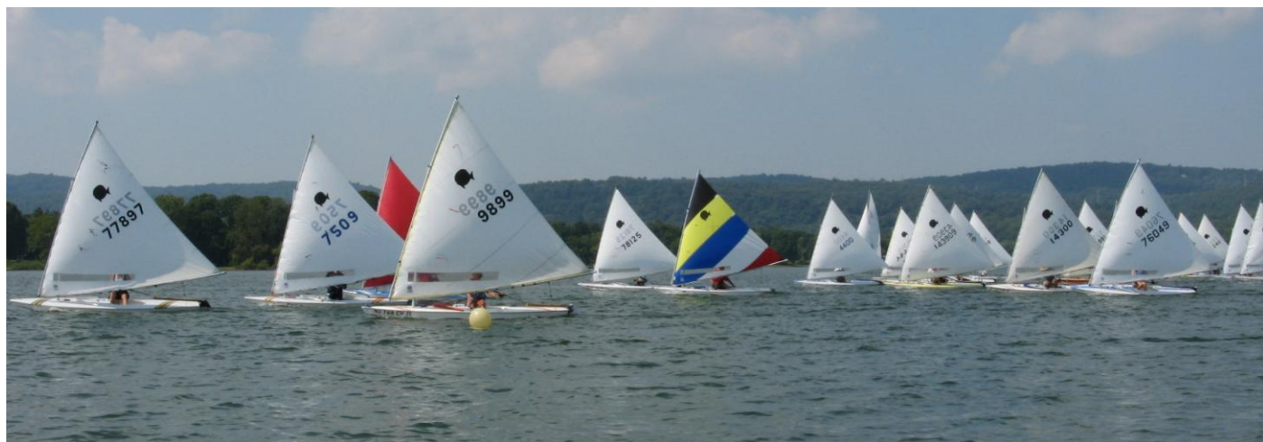
Labor Day Sunfish Regatta

For Membership & Training contact Stacey Bachenheimer at SailHSC@hotmail.com